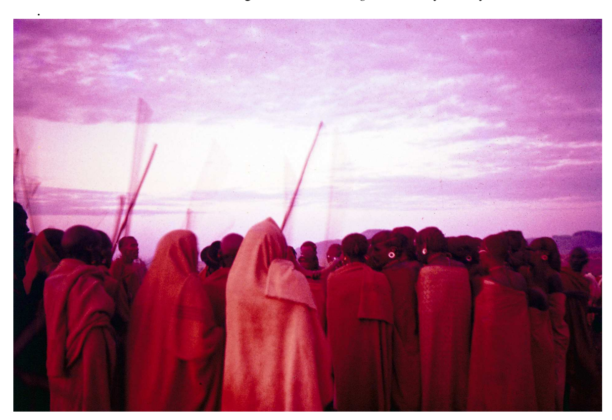
PLATE I. Samburu elders blessing moran at an ilmugit ceremony in July 1958.

Dominating the social life of the Samburu were their ceremonial activities, characterised by meat feasting and the dancing of moran. These would bring together a scattered nomadic population of clansmen from over a wide area. The dynamics of the age system especially involved an extended cycle of ceremonies with elaborate details over which elders would argue. With uncertain memories, no-one could be quite certain which version might or might not be propitious, and it was rare for a ceremony to be completed without some hitch or disputed detail. This added to the drama of communal rituals, which were a matter of celebration, but also of anxiety. The analysis in The Samburu suggested that these apprehensions were also anxieties surrounding the change in social relations that accompanied such events - steps in the process of ageing and an aspect of accommodating these changes through making them very public and bringing them to a head. With changing times, there might also be a reluctant creep of ritual